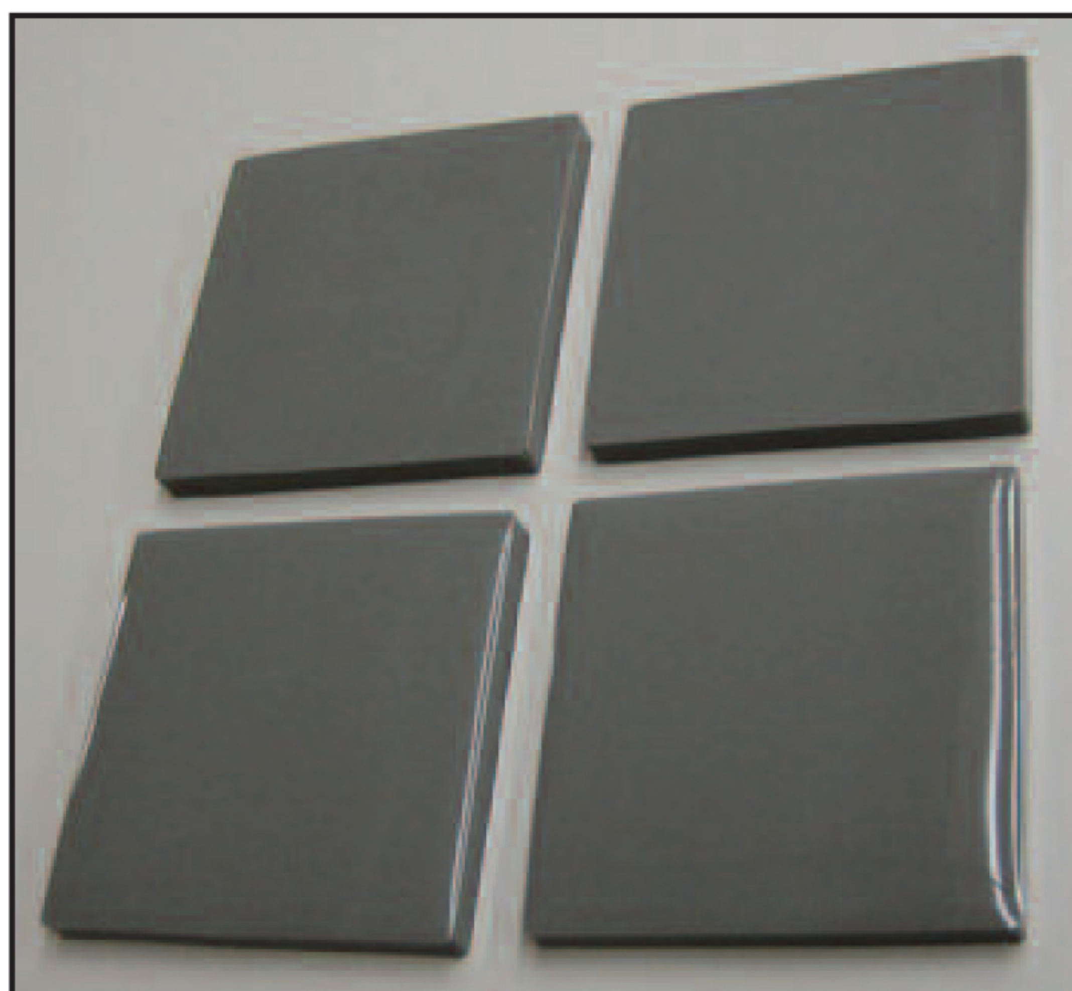
2" x 2" Pads